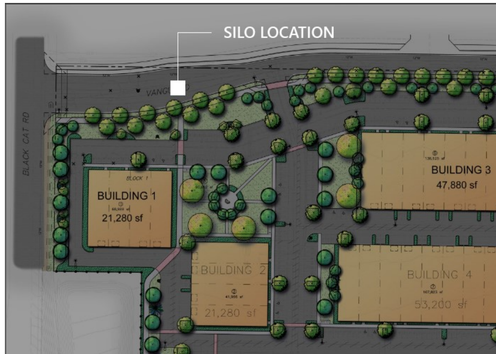
Figure 1 - Silo Location

The silo is presently located in a required ACHD right-of-way for a collector street, Vanguard Street, as identified in ACHD’s Master Street Plan. (See Figure 1 )