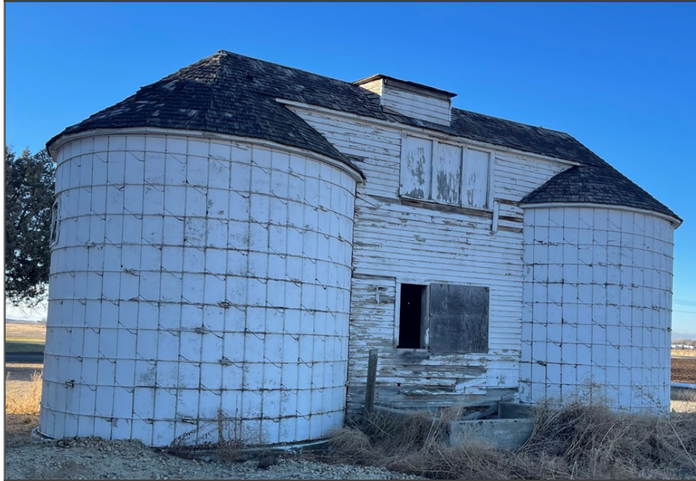
Figure 2 - Silo

At this point in our evaluation, it was clear that leaving the silo in its' current location would not be possible . We then asked a moving company, Pacific Movers, to evaluate the structure for moving and relocating. The moving company determined that it was not feasible to move the structure.